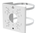
SN-CBK627D Pole Mount